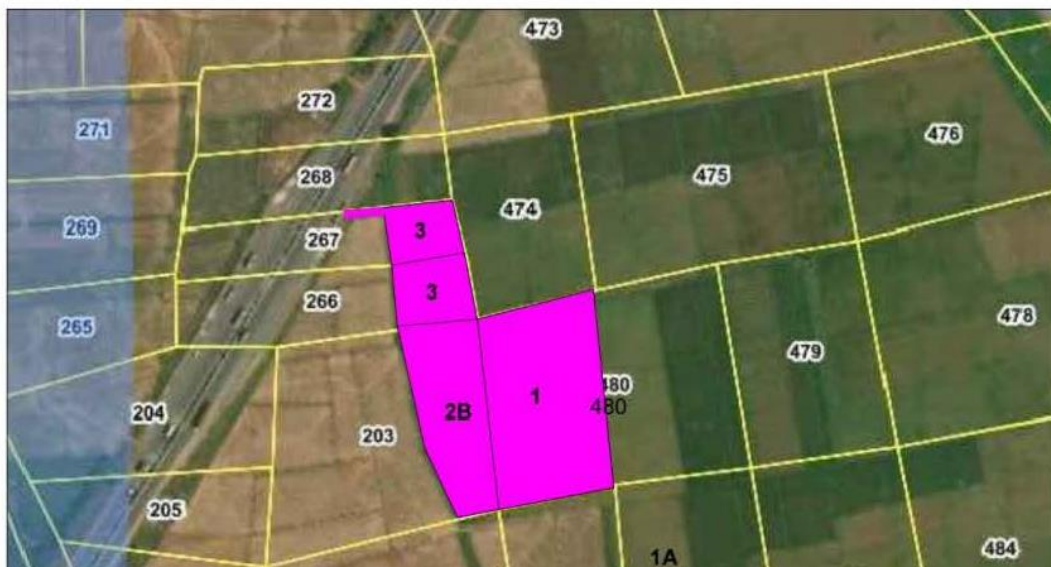
GOOGLE MAP SHOWING THE COMBINED SKETCH SY.NO.S OF 203,266,267&480 IN KONDAYYAPALEM,NELLORE BIT-1,SPSR NELLORE DISTRICT